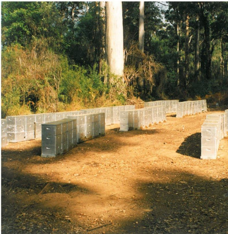
Bee hives in the Karri Forest

Property Unit, Department of Parks and Wildlife (DPaW)